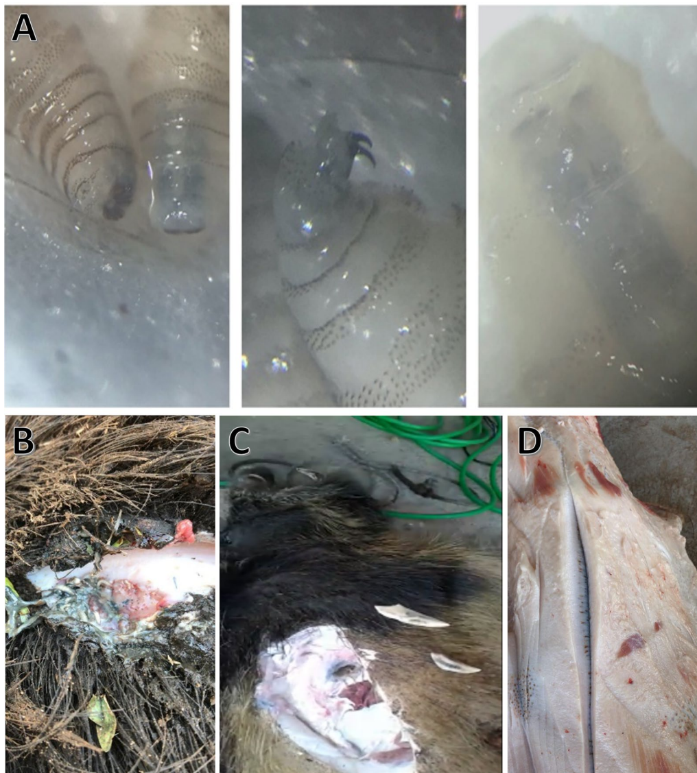
Fig. 2 Images of representative screwworm larvae samples (a, top row), myiasis of a feral swine (b), male shoulder shield that had the tusks of another male broken off and embedded (c), and shoulder shield from a large male split to show the thickness (approximately 5–6 cm) (d)

A total of 618 feral swine were examined during the study period, of which 27 were infested with dipteran larvae (Fig. 1; Table 1). Animal size, sex, location of capture, and area of body infested for the 27 feral swine with myiasis is reported in Additional file 3: Dataset 3. Microscopic examination of the larvae revealed all cases of myiasis were due to infestation by C. hominivorax . The number of infested males was significantly greater than