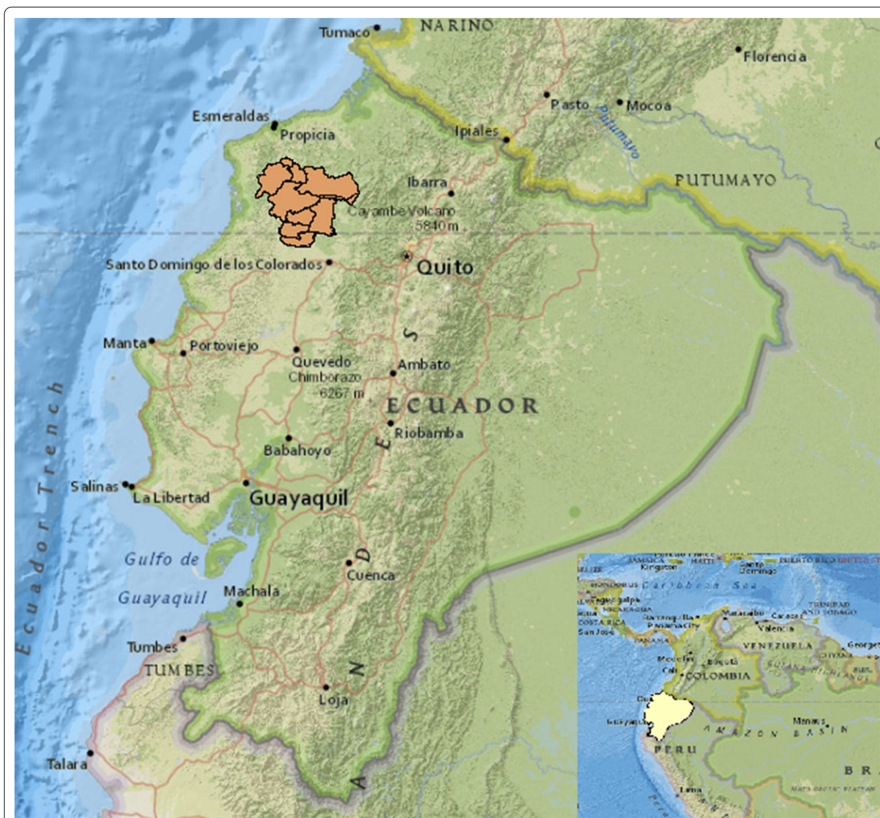
Fig. 1 Map of the study area in the district of Quinindé, Esmeraldas Province, Ecuador

13 months, 49.0% at 2 years, 65.7% at 3 years, and 81.0% at 5 years (Fig. 2). Distributions of potential risk factors and frequencies of Toxocara spp. seropositivity at 2, 3 and 5 years are shown in Table 1. Overall crude and adjusted associations with potential risk factors over the observation period are shown also in Table 1. Variables significantly associated with seroprevalence in adjusted analyses were: age [Odds ratio (OR) 2.06, 95% confidence interval (CI) 1.66–2.56, P < 0.001 ], male sex (female vs. males, OR 0.66, 95% CI 0.48–0.89, P = 0.006 ), maternal ethnicity (non-Afro-Ecuadorian vs. Afro-Ecuadorian, OR 0.65, 95% CI 0.47–0.91, P = 0.011 ), lower maternal