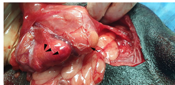
Fig. 1 Arrow indicates adult Dirofilaria repens worms in the hernia sac. Arrowhead indicates white nodules disseminated on the surface of the peritoneum.

The nematodes were collected and stored in absolute ethanol and sent together with a blood sample collected in EDTA tubes to the Department of Parasitology and Parasitic Diseases (Faculty of Veterinary Medicine of