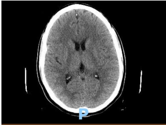
Fig. 1 CT head without any evidence of intracranial changes, cerebral edema, mass effect, or midline changes

outpatient blood testing after discharge from the hospital (Table 1).