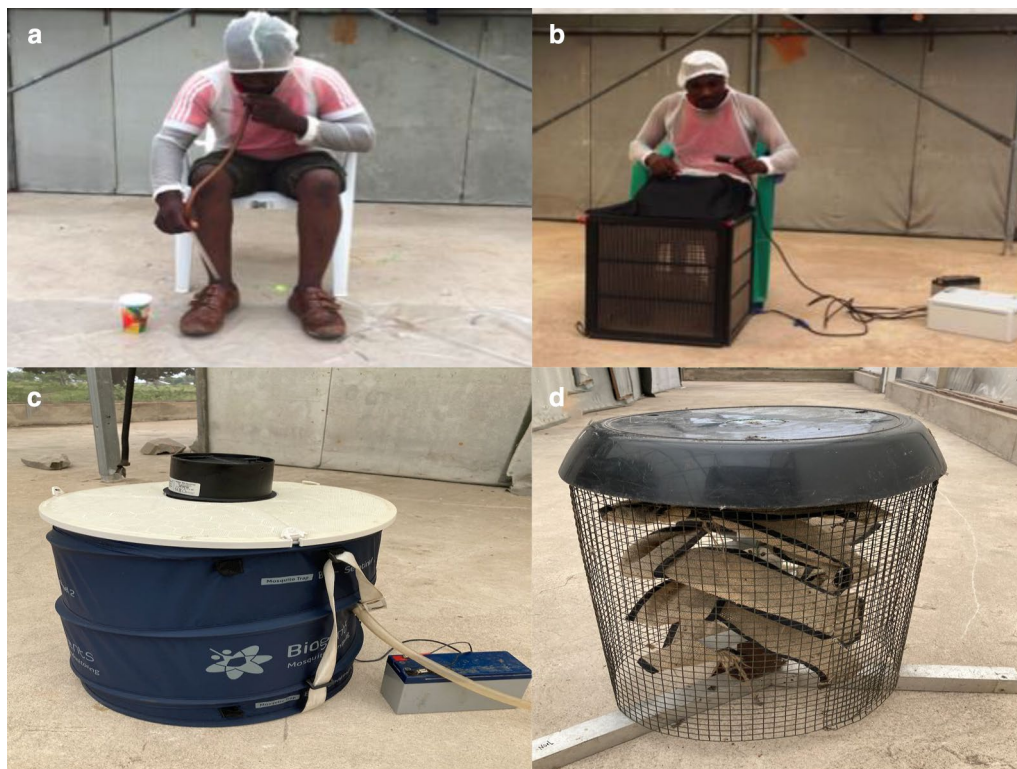
Fig. 2 Collection methods and FTPE used in the study. a A volunteer conducting HLC. b A volunteer sitting on the chair with his leg inserted in an MET. c A BG-Sentinel trap with the battery and silicon tube supplying CO 2 . d An FTPE device as a source of transfluthrin

Previous experiments have demonstrated that METs could be used for sampling Anopheles mosquitoes [23] and Aedes mosquitoes [26]. The MET consists of an electric grid and a power-supply box. The electric grid is made up of four panels, each measuring 30 cm × 30 cm, in a square frame (Fig. 2b). Volunteers (the same as those recruited for HLC) put their legs within the frame in a similar fashion as for HLC, and host-seeking mosquitoes approaching the volunteers are intercepted and killed on their attempt to pass through the electrified grids before landing on a human. In this way, volunteers are protected from mosquito bites and, consequently, from exposure to mosquito-borne infection. Preliminary testing of optimal voltage for electrocution of Ae. aegypti identified that 680 V is sufficient to kill mosquitoes (with the specimen remaining intact) without causing harm in accidental contact with the volunteer. The trap is designed such that electrocution occurs when a mosquito touches the two parallel wires of the electric grid [24].