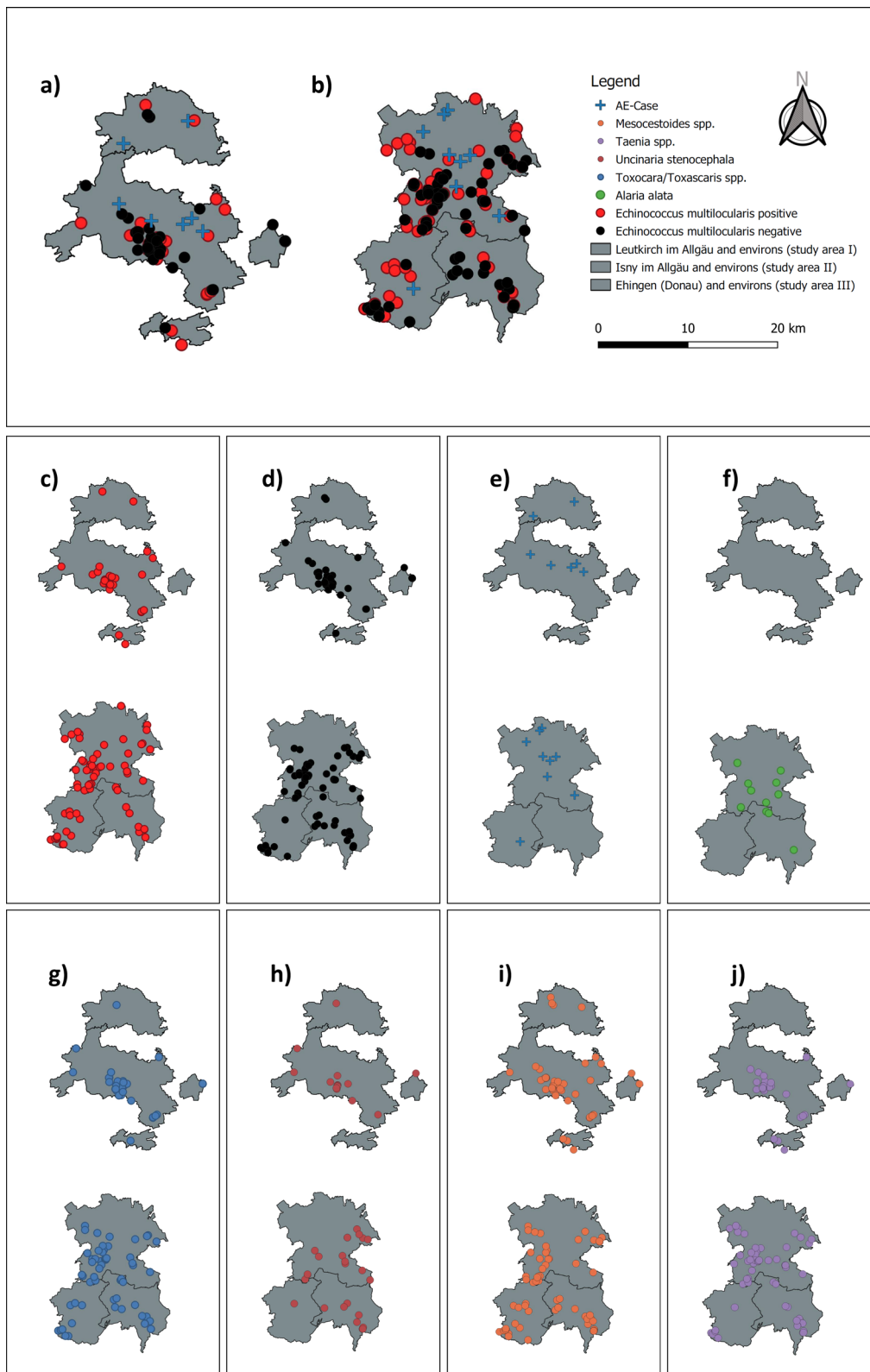
Fig. 2 Geographical distribution of human AE cases and fox infection with E. multilocularis and other helminths. a and b Human AE cases (blue cross), foxes positive (red dot) and negative (black dot) for E. multilocularis . a Study area III; b study areas I and II, c foxes positive for E. multilocularis , d foxes negative for E. multilocularis , e human AE cases, f foxes positive for Alaria alata , g foxes positive for Toxocara/Toxascaris spp., h foxes positive for Uncinaria stenocephala , i foxes positive for Mesocestoides spp., j foxes positive for Taenia spp.