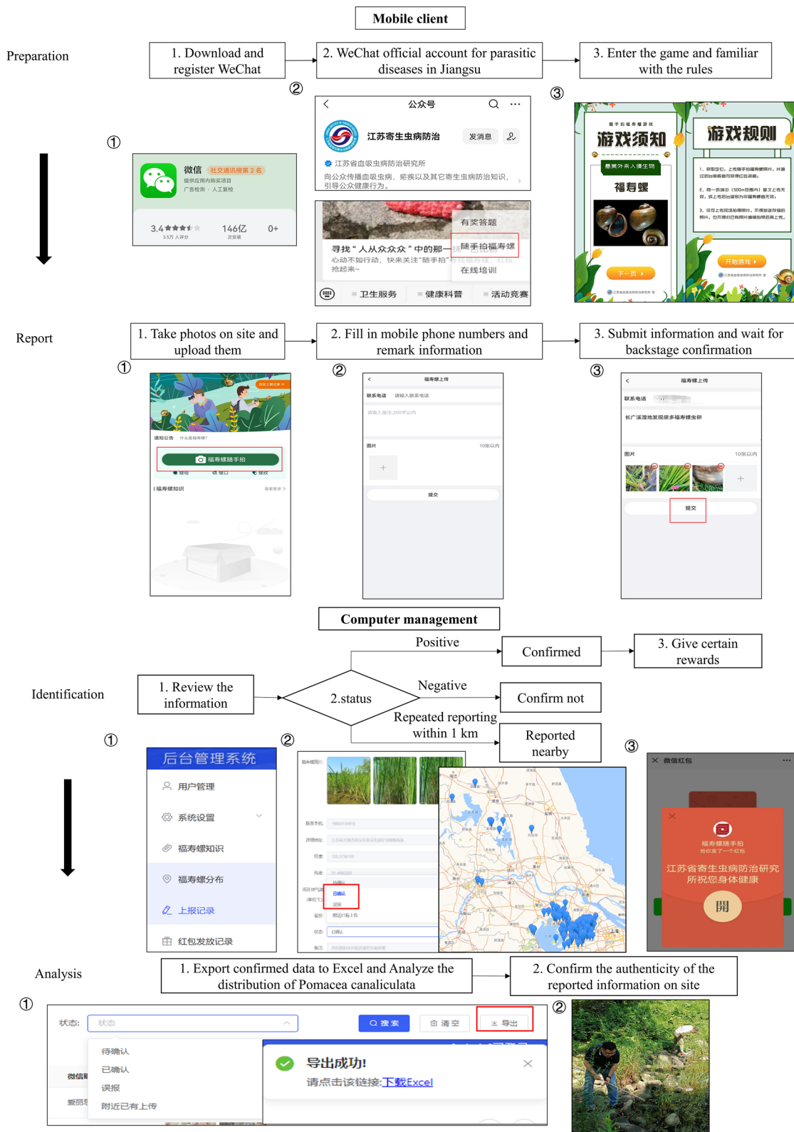
Fig. 1 Introduction to the operation of the ASI and the corresponding screenshots of its mobile client and computer terminal