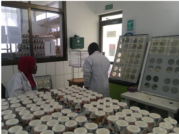
Fig. 1 WHO cone bioassay

kg; (ii) DM at 2 g AI/kg combined with PBO at 8 g/kg, and both incorporated on yarn of 0.152 millimetres (mm) in diameter nets [for unimproved house modification tool: coverage of the eaves (Insecticide-treated eave nets, ITENs) and window screens, ITWS)] [29], formulated by Intelligent Insect Control, France, and supplied by Vegro Aps, Denmark; (iii) Tsara Soft, a polyester ITN coated with 2 g AI/kg DM and made of 100-denier knitted monofilament High Density Polyethylene (HDPE) fibres, manufactured by NRS Moon Netting FZE; (iv) Tsara Soft, which was tested after mosquitoes had been pre-exposed to WHO insecticide-impregnated papers of 4% PBO concentration. The negative control to monitor the quality of experimental conduct was done using an untreated polyester net, SafiNet, manufactured by A to Z Textile Mills, Tanzania. Net pieces were stored in a temperature-controlled refrigerator at 4 °C between tests.