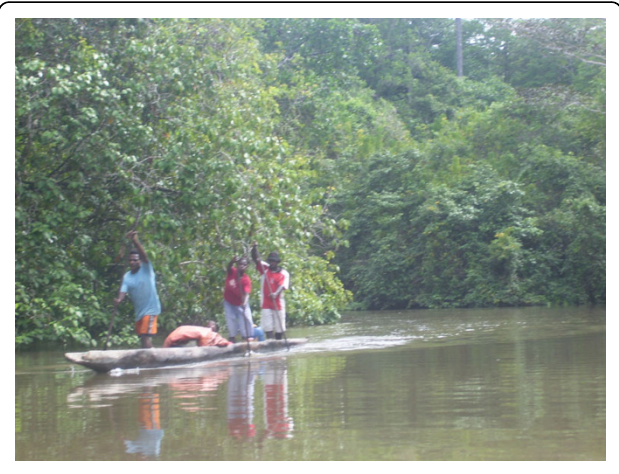
Figure 3 Kolekole.