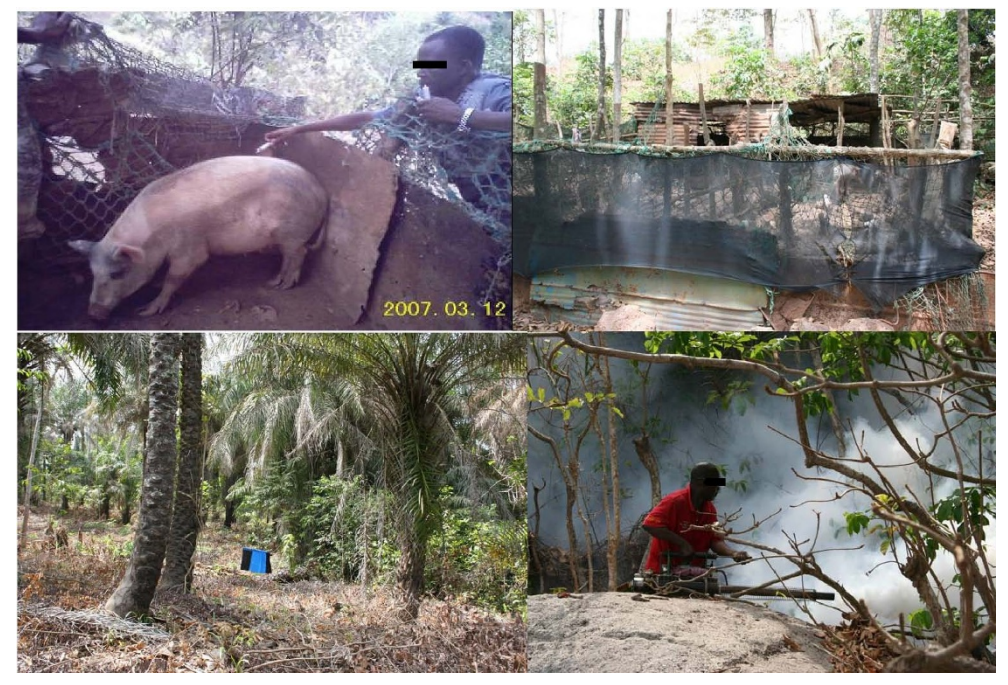
Figure 1 Pictures illustrating the different control techniques used against G. palpalis gambiensis on Kassa island, Guinea. From upper left to lower right are shown epicutaneous treatment using insecticide (pour on) on pigs, deltamethrin impregnated fences around pig pens, a deltamethrin impregnated black/blue/black target in a palm tree plantation, and cyfluthrin groundspraying using a Swinfog SN50.

In addition to these control techniques, we gave special attention to community discussions during each of the interventions. This has been essential to promote community understanding and acceptance of the