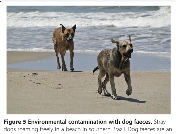
dogs roaming freely in a beach in southern Brazil. Dog faeces are an important source of zoonotic parasites that may cause diseases such as cutaneous larva migrans .

Tapeworms are also an underestimated problem in Brazil and other South American countries. For instance, human cases of D. caninum have been described in Brazil [286-288]. Indeed, the high prevalence of D. caninum in dogs in Brazil (e.g., 45.7% in north-eastern and 36.8% in south-eastern Brazil) [32,36] is a consequence of the high prevalence of flea and lice infestations reported in different regions of the country [18,28,30,32,35] and indicates a