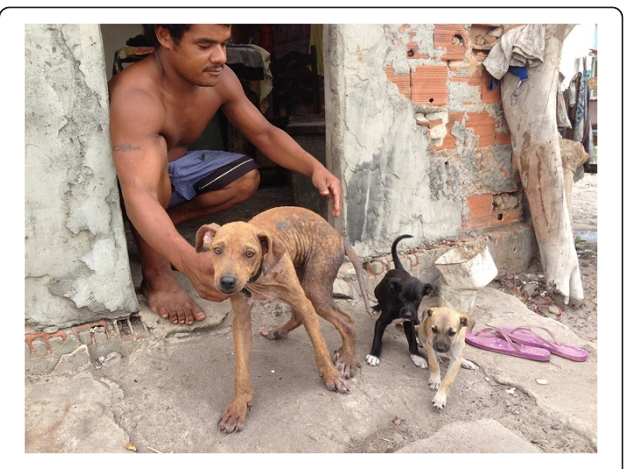
Figure 2 Poor living conditions. An owner and his dogs living in a poor rural community in Goiana, north-eastern Brazil, where visceral leishmaniosis is endemic. In poor rural communities people (as this man in the picture) are used to walking barefoot, which is a risk factor for bare feet-related diseases, such as cutaneous larva migrans and tungiasis.

Brazil is a country with continental dimensions (i.e., 8,515,767 km<sup>2</sup>), occupying most of the land area of South America and representing the largest economy in the region. Despite the persistent social and economic inequalities (e.g., unequal access to education, health care and sanitation, safe drinking water and decent housing), which have become the dark side of the Brazilian history, the importance of dogs and cats as pets, as well as the demand for high standard veterinary services, has increased over the last decades in Brazil. Impressively, according to the Associação Brasileira da Indústria de Produtos para Animais de Estimação (Abinpet), Brazil currently holds the world's second largest dog and cat populations, with over 37 million dogs and 21 million cats (http://abinpet.