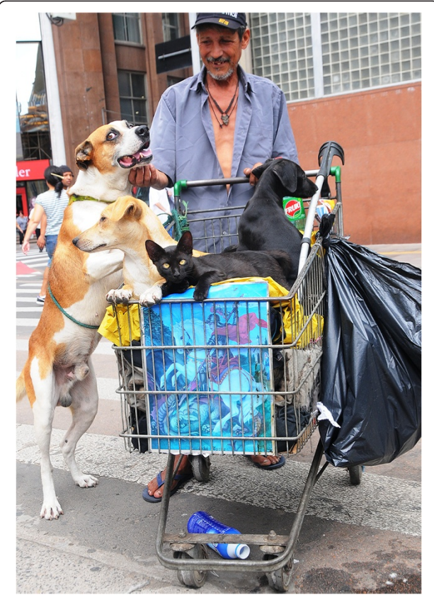
Figure 1 Human-animal bond. A homeless with his inseparable friends that were found abandoned in the streets of Porto Alegre, southern Brazil.

populations in tropical and subtropical regions around the world [5-7]. Furthermore, the impact of some of these diseases is disproportionally higher in developing countries such as Brazil, because the living conditions of the populations often favour the exposure to certain parasites, whose transmission may be associated with poor housing and sanitary conditions (Figure 2), as well as with inequities in the access to education and primary healthcare services.