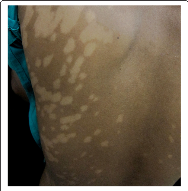
Fig. 2 Typical PKDL from Bangladesh with (confluent) macular rash. ©World Health Organization, 2012. Reproduced unmodified from reference [77]

In this paper we describe the principal immunological features of PKDL, in particular in relation to VL, and correlate these findings with clinical and epidemiological knowledge. In addition issues in immunosuppression