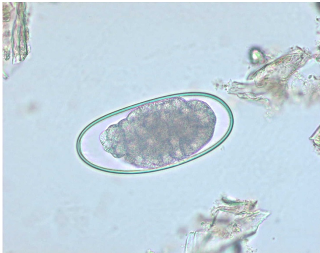
Figure 1 Egg of cyathostomins.

each treatment group. Faeces were mixed with oak sawdust and water. Coprocultures were incubated for 10 days at 27°C and after incubation third-stage larvae (L3) were harvested using the baermann technique, examined using a light microscope and identified using morphological keys [9].