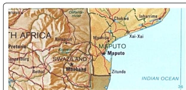
Figure 1 Map of southern Mozambique showing Manhica north of the capital of Maputo.

The field site at Maragra was visited for two weeks per month from January to March 2009. Mosquitoes were sampled by indoor house searches, knock down collections, window exit traps, natural shelters and pit traps from areas inside and outside the sugar estate control