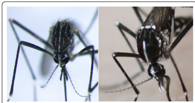
Figure 2 Particular of the mesonotum of Aedes koreicus (left) compared to Ae. albopictus (right).

albopictus , which is mainly based on the use of inexpensive ovitraps. The detection of the typical black Aedes eggs in ovitraps, easy recognizable by non-expert personnel, was sufficient to determine the infestation status of a location with regard to the tiger mosquito. Unfortunately, tiger mosquito eggs are indistinguishable by simple observation under a binocular microscope from the eggs of other Aedes spp., including those of Ae. koreicus . Hence, the species identification at a routine basis in areas where Ae. albopictus and Ae. koreicus may share the same breeding sites, will require to rear the eggs in the laboratory or to include into the surveillance system the more laborious systematic collection of larvae and adults, which require an equipped laboratory and well trained personnel for identification (Figure 2).