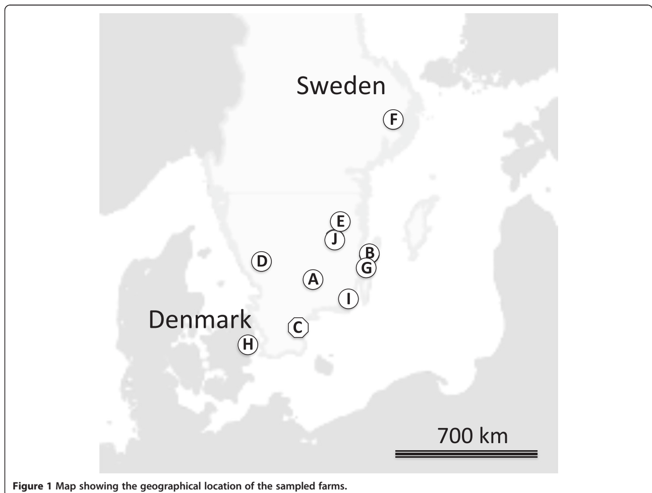
Figure 1 Map showing the geographical location of the sampled farms.

as diploid dominant markers, assuming that each fragment represents a single locus with two alleles, where fragment presence represents the dominant allele. Hardy-Weinberg equilibrium ( F_{is} = 0 , so that inbreeding is absent) is also assumed, as is the absence of sequence recombination. Conversion of data formats used