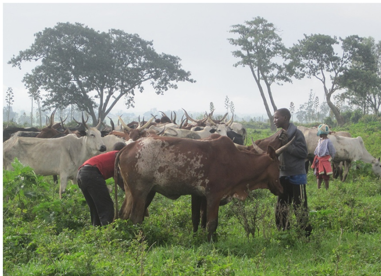
Figure 2 Young Fulani herders from the Plateau removing ticks manually from their cattle.

The paucity ( n = 26 ) of adult H. rufipes collected in this study could indicate a small population of this species, known to be widely distributed in the most arid parts of tropical Africa [43]. Adults of H. rufipes are usually more numerous in the early part (i.e., June-July in Nigeria) than towards the end of the rainy season [44]. It is also possible that the altitude of the Jos Plateau might have acted as a further limiting factor to the establishment of an H. rufipes population. Considering that both larvae and nymphs of this two-host tick parasitize ground-feeding birds [45], it is likely that the adult specimens came from the moult of engorged nymphs brought to the study area by birds living in close contact with the herds (e.g., cattle egrets, oxpeckers, guinea fowls, etc.). Interestingly, no H. rufipes ticks were collected from calves (Table 4), suggesting that open pastures, grazed mainly by adult cattle, represent the most likely interface between cattle and these birds. Although scanty, the presence of this tick species is still of veterinary importance as it is known to transmit A.