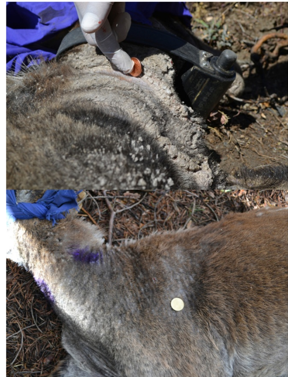
Figure 2 Photos showing the decrease of mange lesions and the recover of the normal skin and hair of one collared resistant Iberian ibex (up = before, down = after), Sierra Nevada, Spain.

S. scabiei entails significant mortality in both wild and domestic animals, with considerable economic losses [15-17], and ravages in human populations [18].