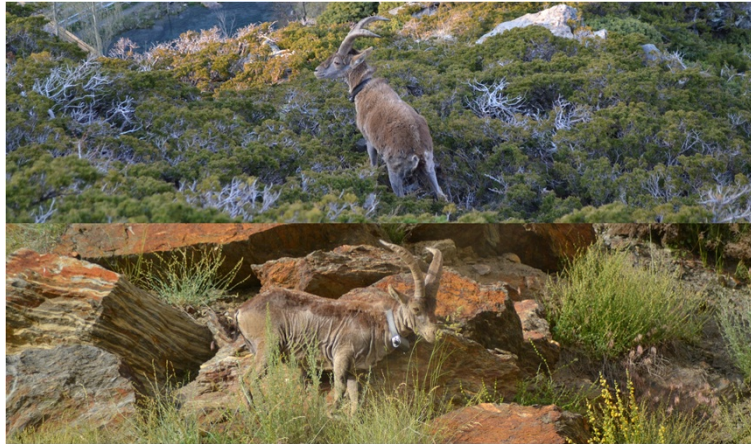
Figure 3 Photos showing the increase of mange lesions and the loss of hair of one collared non-resistant Iberian ibex (up = before, down = after), Sierra Nevada, Spain.

and (iii) the recovery time of the resistant ones, if any. Such aspects are almost impossible to approach by the direct observation of the affected animals, based on the limited access to different parts of Sierra Nevada because of the harsh climatology and territory of this mountain range and the absence of adequate roads. And hence the pivotal role of the gps-gsm radio collars, which allow localizing the marked animal at any time.