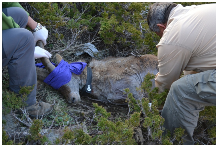
Figure 1 Mangy Iberian ibex capturing and gps-radio collaring, Sierra Nevada, Spain.

Iberian ibex ( Capra pyrenaica ) population from Sierra Nevada mountain range in Spain is one of the most affected by S. scabiei [19-21]. Nonetheless, there are no clear studies about (i) the possible resistance of Iberian ibex to S. scabiei , (ii) the average survival time of the non-resistant animals,