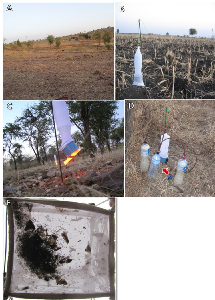
Figure 1 (A-C) Field work in, Tigray, Northern Ethiopia: A) Rocky plain with sparse vegetation near the village of Ademeiti. B) Deeply cracked vertisol in a fallow sorghum field near the village of Gueza Meker showing a 3 V CDC trap. C) Sparse woodland near the village of Erdweyane with a 3 V trap baited with red light-stick. Note up-draft orientation of the traps. D) A 3 V CDC trap, baited with sugar-yeast mixture (SYM) producing CO 2 as attractant. Note two bottles filled with SYM joined via an empty bottle serving to catch foam. Arrow points to the CO 2 outlet under the trap which is deployed in the up-draft orientation. E) Typical catch of a down-draft 6 V incandescent light trap in Sheraro. To process and separate the sand flies from the rest of the insects in such catches can take up to an hour.

Experiments were conducted using CDC type suction traps deployed in the up-draft orientation with their opening about 15 cm above ground level. Suction traps deployed in the inverted (=updraft) orientation were