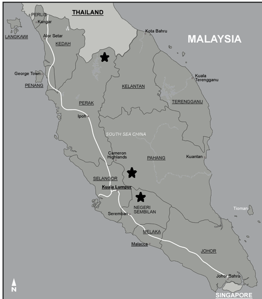
Figure 1 Map showing the location of the villages in Peninsular Malaysia involved in the study (stars).

container. Then, the container was placed in a zip-locked plastic bag. Parents and guardians were instructed to monitor their children during the sample collection in order to ensure that they placed their faecal samples into the correct container. All study participants were asked to provide a sufficiently large faecal sample (at least 10 grams) so that both formalin-ether sedimentation and trichrome staining techniques could be performed. This study had to rely on a single faecal sample collection because of the limitation of resources and the cultural belief of the aborigines against giving of their faecal samples.