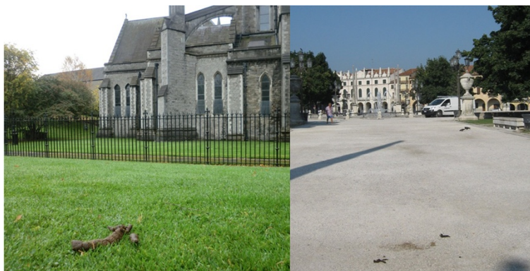
Figure 4 Dog faeces in a green park of Dublin, Ireland (left) and in a public square of Padua, Italy (right).

developed to discriminate eggs of ascarids in soil samples [107,108], although some pitfalls may impair a routine use, e.g. low throughput analysis and risk of carry-on contamination. A duplex Real-Time PCR has been recently validated for the detection and discrimination of T. canis and T. cati eggs in different samples, including soil. This assay is promising for the implementation of standardized methods able to evaluate the presence of roundworm eggs in contaminated soil on a large scale. In particular, this novel molecular tool can be used to investigate, with a high throughput, the occurrence and the level of contamination of eggs of T. canis (and T. cati ) in urban parks, green areas, playgrounds and sandpits [109].