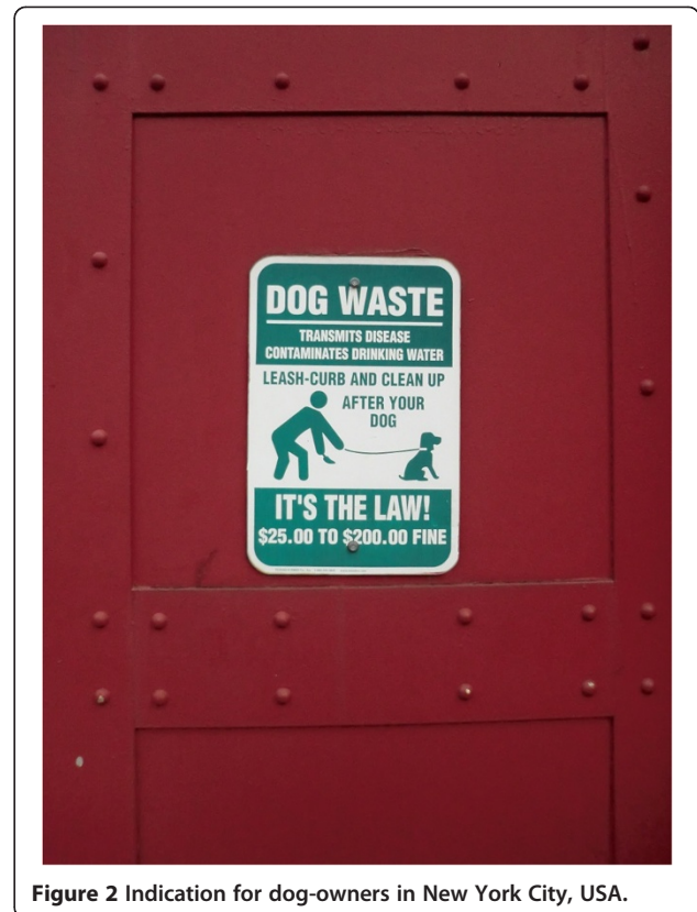
Figure 2 Indication for dog-owners in New York City, USA.

Other than constant municipal cleaning and maintenance, controlled access of green areas and public parks by fences is an effective way of prevention of faecal contamination. A study in Japan has shown that placing vinyl plastic covers over sandboxes at night is able to discourage animals from defecating there [105]. An extreme measure chosen by some municipalities is the elimination of sandboxes from