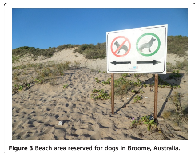
Figure 3 Beach area reserved for dogs in Broome, Australia.

Surveillance of the presence of parasite eggs in public soil is also important in this integrated approach to control intestinal parasites. In general, microscopic examination of soil samples is performed to identify Toxocara eggs, although this method may have low sensitivity and specificity [106,107]. DNA-based approaches have been