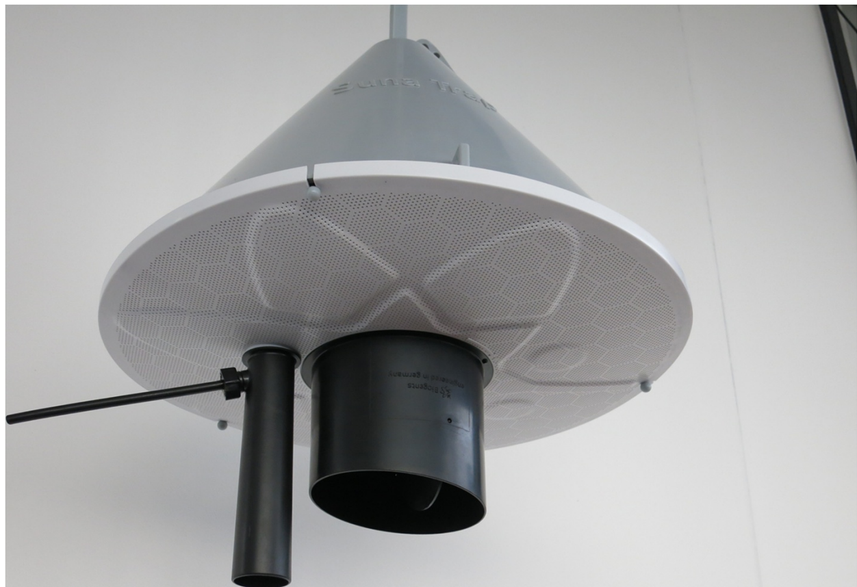
Figure 3 Suna trap with a plastic base with fine holes.

A report compiled from routine informal conversations with household members during the period they had a SMoTS for piloting revealed that households expressed