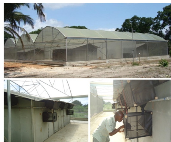
Figure 1 Semi-field system and experimental hut at the Ifakara health Institute, Bagamoyo, Tanzania.

Disease-free and blood-naïve female Anopheles gambiae s.s. (Ifakara strain), aged 2-5 days old were used in this study. These mosquitoes were reared under natural photoperiod at 27°C and 80% humidity, in Kingani insectary laboratory