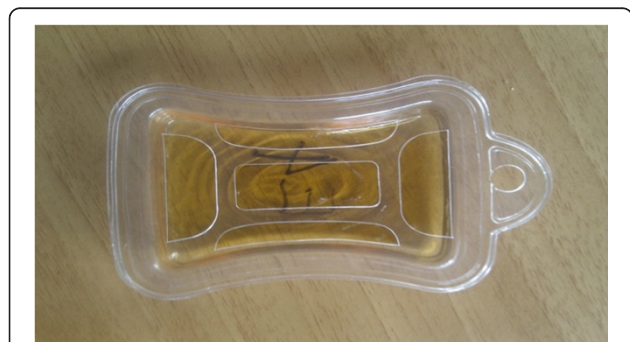
Figure 2 Linalool 73% agar gel emanator.

from separate SFS compartments were assigned the same treatment consisting of two 73% d-linalool emanators hanging approximately 1.5 m high above the ground and 1 m from each corner, these emanators were fixed throughout experimental night. The other two huts were randomly allocated two transfluthrin 0.03% mosquito coils lit on plates placed in two mid points of the hut and one hut was left with no treatment. In both experimental huts, two participants slept on a mattress at the center of the hut with.