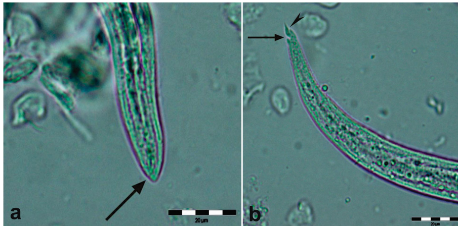
Fig. 2 First stage larva (L1) of Troglostrongylus brevior . a Anterior end with a subterminal opening (arrow). b Pointed tail with a pronounced dorsal (arrow) and shallow ventral (arrowhead) incisures and spines typical of T. brevior . Scale-bars: 20 µm

positive for T. brevior , with a 100 % homology with the GenBank® sequence KF241978.1.