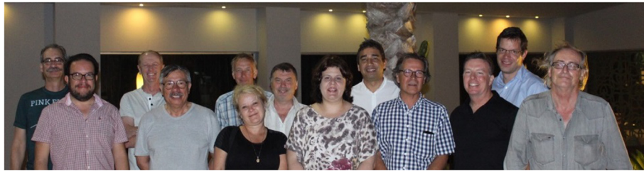
Fig. 1 The participants of the official launch meeting of CATVAC. G.A. Scoles not on the picture. This meeting was held in Mohammedia, Morocco, July 14–15, 2015

strain involved [6]. Moreover, post-engorgement female mortality and effects on female fertility may reduce the number of infective larvae by up to a maximum of 90 %, depending on tick strains [6]. Additionally, Peter Willadsen indicated that Bm86 produced in Escherichia coli and baculovirus has also been successfully used as vaccine antigens [7].