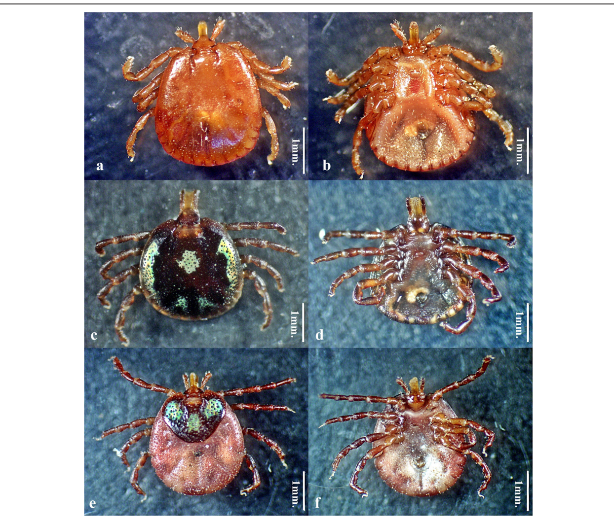
Fig. 1 Pictures of ticks identified in this study. a Amblyomma pattoni, male, dorsal view. b Amblyomma pattoni, male ventral view. c Amblyomma varanense, male, dorsal view. d Amblyomma varanense, male, ventral view. e Amblyomma varanense, female, dorsal view. f Amblyomma varanense, female, ventral view. Scale-bars: 1 mm

Ticks were collected from the following five snake species: Python reticulatus, Ophiophagus hannah, Ptyas korros, Naja kaouthia and Elaphe radiata . Four Amblyomma varanense ticks (three males and one female) were collected from one P. reticulatus. One A. varanense tick (one female) and two Amblyomma pattoni (males) were collected from O. hannah. Two A. pattoni (males) were collected from N. kaouthia. In addition, two A. pattoni males