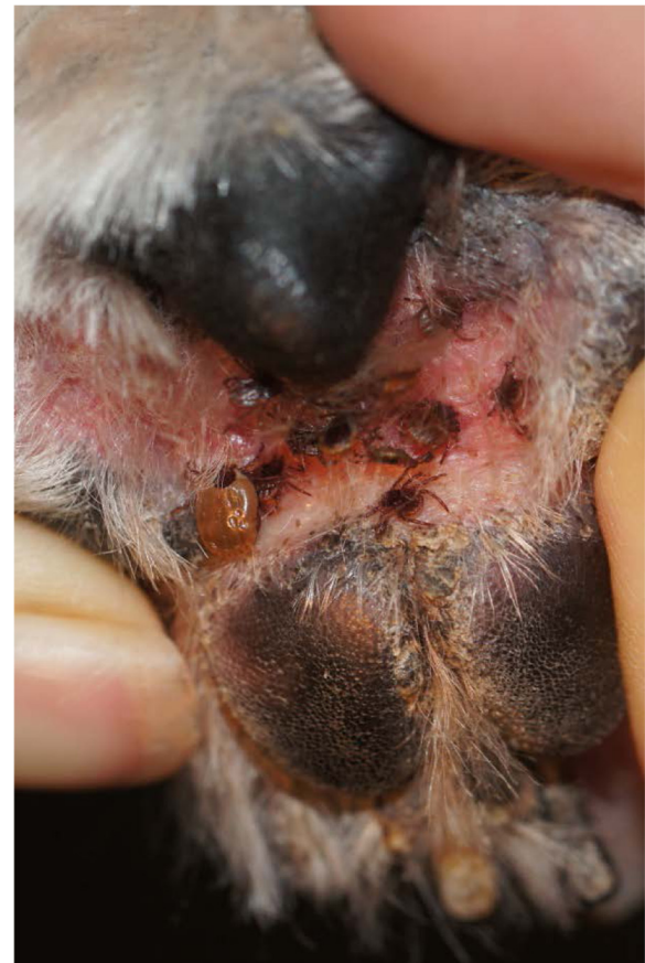
Fig. 2 Paw of a dog treated 7 days previously with a permethrin combination product showing multiple attached Rhipicephalus sp. ticks.

Persistent efficacy is very important because of the need to maintain ectoparasiticide control throughout the retreatment interval to reduce the arthropod-borne disease transmission risk. A repellent treatment would offer better reduction of tick-borne infection transmission if it could completely prevent all arthropods from