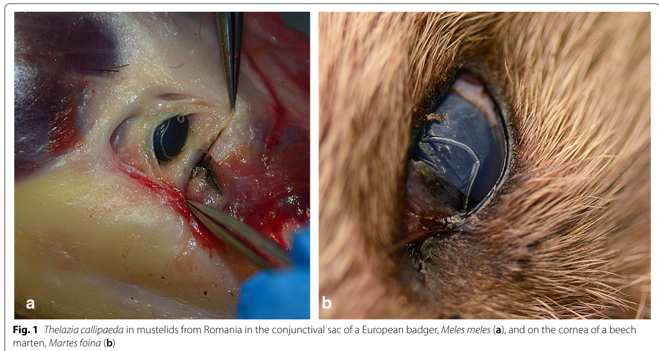
Fig. 1 Thelazia callipaeda in mustelids from Romania in the conjunctival sac of a European badger, Meles meles (a), and on the cornea of a beech marten, Martes foina (b)