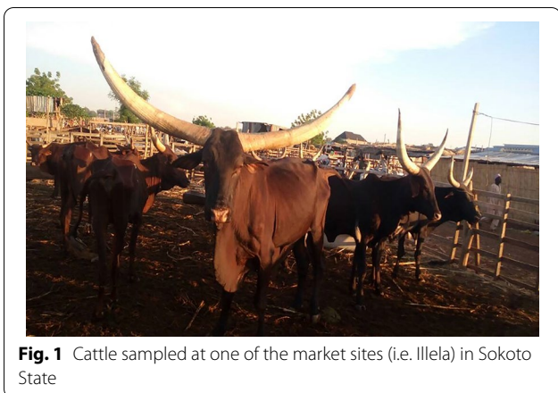
Fig. 1 Cattle sampled at one of the market sites (i.e. Illela) in Sokoto State

or open savanna woodland, with fine- and broad-leaved trees and shrubs, which are deciduous for several weeks [48].