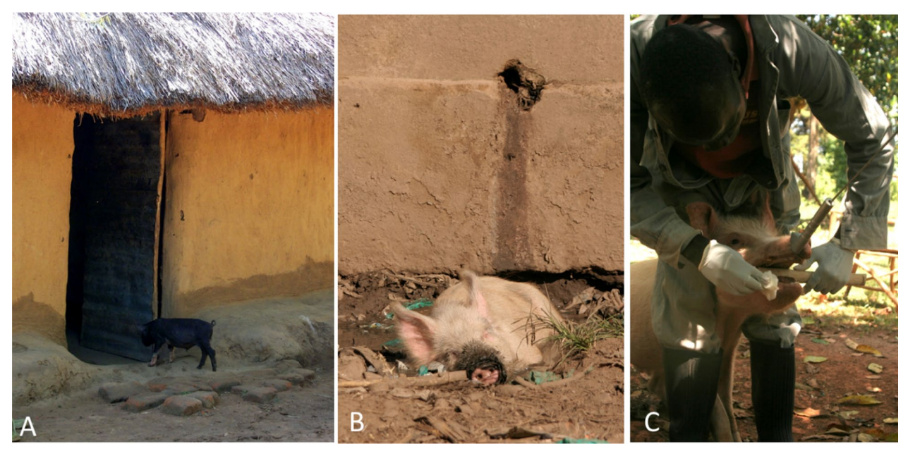
Fig. 2 A Lack of separation between pig and human habitats, as illustrated in (A); where pigs are allowed to roam freely, the potential for pigs to come into contact with human faecal material containing infective eggs is increased. B Pig wallowing in a pit containing human excrement from a draining latrine. C Assessment of pig cysticercosis by tongue palpation.

of antibody levels between samples. In one study, this assay was used for evaluating two recombinant antigens, rT24H ( T. solium -specific) and r2B2t ( Echinococ cus granulosus -specific) for simultaneous and differential diagnosis of NCC and cystic echinococcosis. For the diagnosis of NCC, the sensitivity and specificity of this assay ranged from 57.94 to 63.49% and 90.87–91.30%, respectively [34].