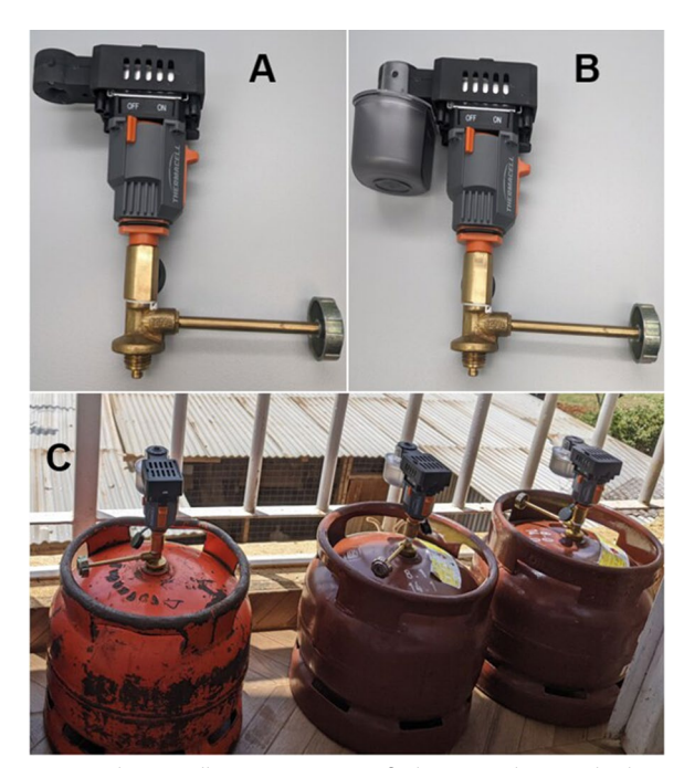
Fig. 2 A Thermacell emanator, B metofluthrin cartridge attached to the Thermacell emanator–metofluthrin SR container, C Thermacell emanator attached to 6-kg gas cylinders

HLC was conducted for 12 h (18:00-06:00) every night for five nights inside the experimental huts as shown in