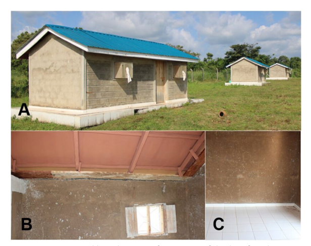
Fig. 1 Experimental hut design: A front view of the hut fitted with window exit traps, B showing the wood baffles, and C showing the tiled floor and the hut interior walls

The trial was conducted in two phases, with phase 1 evaluations being carried out indoors in experimental huts and phase 2 evaluations conducted outdoors in compounds in the nearby village. The study used two collection methods to assess the effectiveness of the emanator in preventing mosquitoes from landing on study participants and entering the huts. Human landing catch (HLC) was used to determine the landing rates of mosquitoes on humans [23], both indoors and outdoors, while mouth aspiration was used to determine indoor resting density as a measure of the deterrence and induction