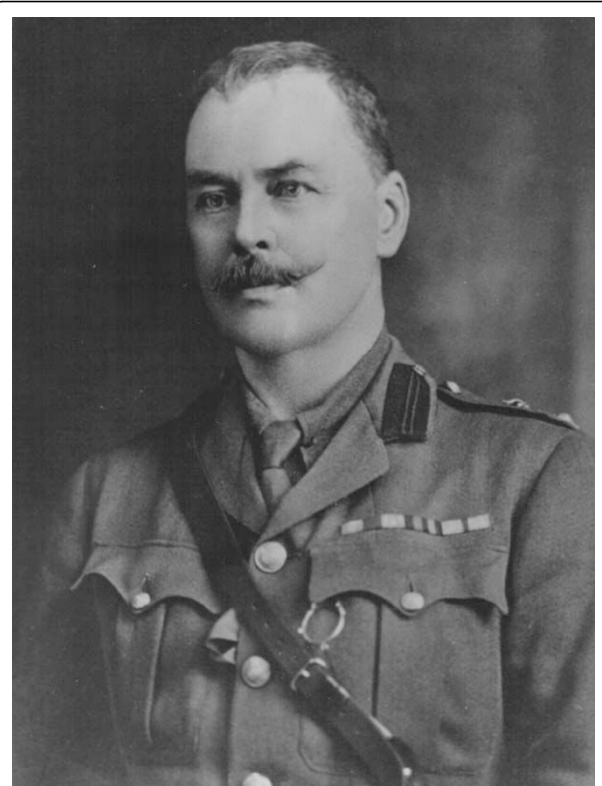
Figure 2 Ronald Ross 1857-1932. Portraits of other scientists who were involved in the elucidation of the life cycle of the malaria parasites can be found elsewhere [9,40].

Ronald Ross 1857-1932. In 1897 Ronald Ross working in India discovered that culicine mosquitoes transmitted the avian malaria parasite Plasmodium relictum and suggested that human malaria parasites might also