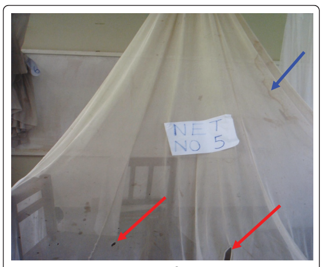
Figure 1 A sample PermaNet<sup>®</sup> 2.0 collected from the community houses after 5 years of use. A RED arrow points the holes which are due to mechanical contacts with bed angles while a BLUE arrow shows a mark on the net due to the firewood smoke indoors.

A total of sixty PermaNet® 2.0 were distributed in lower Moshi, north-eastern Tanzania to the households in 2005 and evaluated in 2010. The active ingredient measured among these nets at the time of distribution was 55 mg/m<sup>2</sup> of residual deltamethrin [12]. Of all (n = 60) the LLITNs (PermaNet<sup>®</sup> 2.0) distributed in the community, only 7 (11.7%) were still in use during the five years follow-up period. This result indicates a very poor retention of mosquito nets in Tanzanian community, a finding that is consistent with previous observations from several countries in Africa [14-16]. The durability was defined by the number of holes in nets used by the community for a period of five years. The seven retained nets were found to have a limited number of holes along bed angles contacts, meaning none had very good durability. Considering the strength of the high technology used to make the fibers of these nets [17], these holes could be attributed to the rough use of the community as it were found to be on the lower area of the net indicating tough mechanical tearing of the beds edges (Figure 1). It is known that, the presence of holes in long-