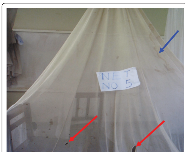
Figure 1 A sample PermaNet ® 2.0 collected from the community houses after 5 years of use. A RED arrow points the holes which are due to mechanical contacts with bed angles while a BLUE arrow shows a mark on the net due to the firewood smoke indoors.

On each net, four WHO contact bioassay cones were attached and a total of 10 mosquitoes were introduced into each cone. Two to three days old, unfed female of An. gambiae mosquitoes were used [23]. Wild populations of An. arabiensis and Cx. quinquefasciatus were collected from an area described by reduced susceptibility to pyrethroid insecticides [21,22]. The mosquitoes were exposed on each net for 3 minutes and then transferred to holding paper cups and provided with 10% sugar solution soaked in absorbent cotton wool [23-25].