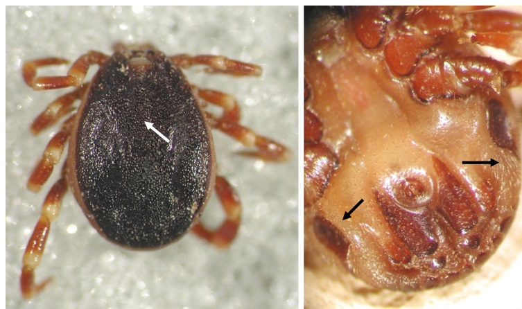
Figure 2 Key features for the identification of H. m. rufipes males in the present study. Arrows indicate dense punctuations dorsally (left) and setae around the spiracles ventrally (right).

The main host of adult H. m. rufipes is cattle, but wild ungulates are also frequently infested [4]. However, during the present survey this tick species was absent from game animals. One factor that may have contributed to this is that Hyalomma spp. prefer open country habitats [5], therefore are more likely to attach to cattle which