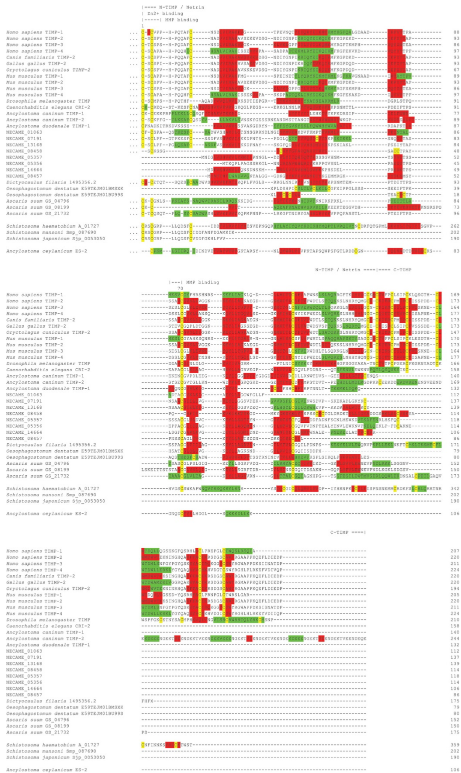
Figure 1 (See legend on next page.)