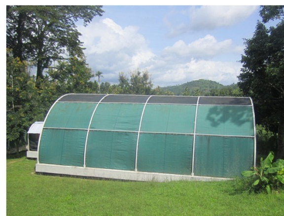
Figure 1 A picture of Semifield structure.

The semi field structure environment has been constructed to mimic local, outdoor conditions [20]. The semi field structure has a dimension of 12.2 m long and 8.2 m wide (Figure 1), allowing wind flow, precipitation and creating similar climatic conditions to ambient conditions. Entrance into the sphere is through a double door system; a wooden door provides entrance to the sphere, after passing through a small corridor (3.0mlong and 2.2 m wide) covered with plastic transparent roofing material, with a screened door to the outside. This prevents escape of released mosquitoes and entry of wild mosquitoes. There is some vegetation grown in semifield structures to mimic the natural land cover. Semi field protocol was used as described in WHO manual [19]. The same dosages used in the laboratory were used in semi field. The main difference with laboratory trials, in semifield the microcosm was exposed to sunlight and night weather without control of any parameter such