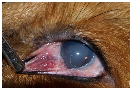
Figure 2 Adult specimens of zoonotic Thelazia callipaeda in the left eye of a red fox.

(Piedmont, latitude: 45° N; [4]) and France (latitude: 45° N; [5]). The climate and habitat conditions of the studied areas are similar to those above northern Italy and France, as the southern part of the country (Herzegovina) is more similar to those of southern Italy, where canine thelaziosis is highly endemic [4,23]. Accordingly, all the areas under investigation fall within the provisional model for the distribution of P. variegata [23], indicating the power of such a geoclimatic model.