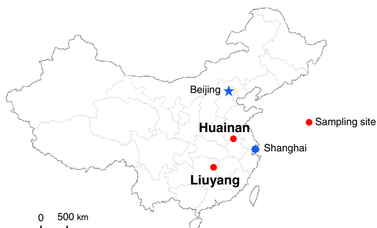
Figure 1 A map of China showing the distribution of mosquito sampling sites.

tube test [11]. For the third method, adult mosquitoes reared from field-collected larvae, 2,000 larvae from more than 100 larval habitats were collected using the standard 350 ml dippers. The larvae were transported to the local rearing facility and reared to adults, and female adults 3–5 days post emergence were tested for deltamethrin resistance using the standard WHO tube [11]. A laboratory susceptible strain that has been maintained in the insectary of the Chinese Center for Disease Control and Prevention in Shanghai, China, for more than 30 years with no insecticide exposure was used as the reference susceptible strain.