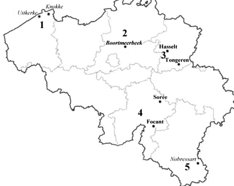
Figure 3 Location of the ponds where Fasciola sp. infected snails species were found: 1) Polders, 2) Sand region, 3) Loam region, 4) Chalk region, 5) Gutland; Bold for G. truncatula ; Italic for Radix sp.; Italic and bold for pond where G. truncatula and Radix sp. were found infected.

intermediate hosts in Belgium. One hundred and twenty five ponds and sixteen other interesting areas in five different biogeographic regions in Belgium and Luxembourg were sampled for snails with environmental factors information. In Belgium in 2008, winter and spring were particularly mild. Furthermore, during that summer the rainfall and the number of rainy days were quite abnormal (Royal Meteorological Institute of Belgium; http://www.meteo.be ). Those conditions are the most suitable for snail development. More than half of these biotopes (53.2%) were colonized with lymnaeid snails. Soil composition in Flanders (sand, silt) in Polders, Sand Region, and Loam region seem to be suitable for the development of lymnaeid snails. A great diversity in shell morphology with extremely homogenous anatomical traits created a great confusion regarding the systematics of lymnaeids especially