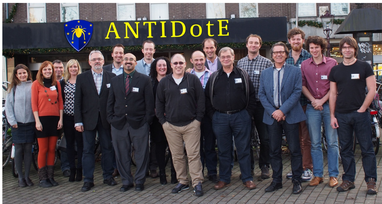
Figure 1 The participants of the official launch meeting of ANTIDotE. This meeting was held in Amsterdam, The Netherlands, in December 2013.