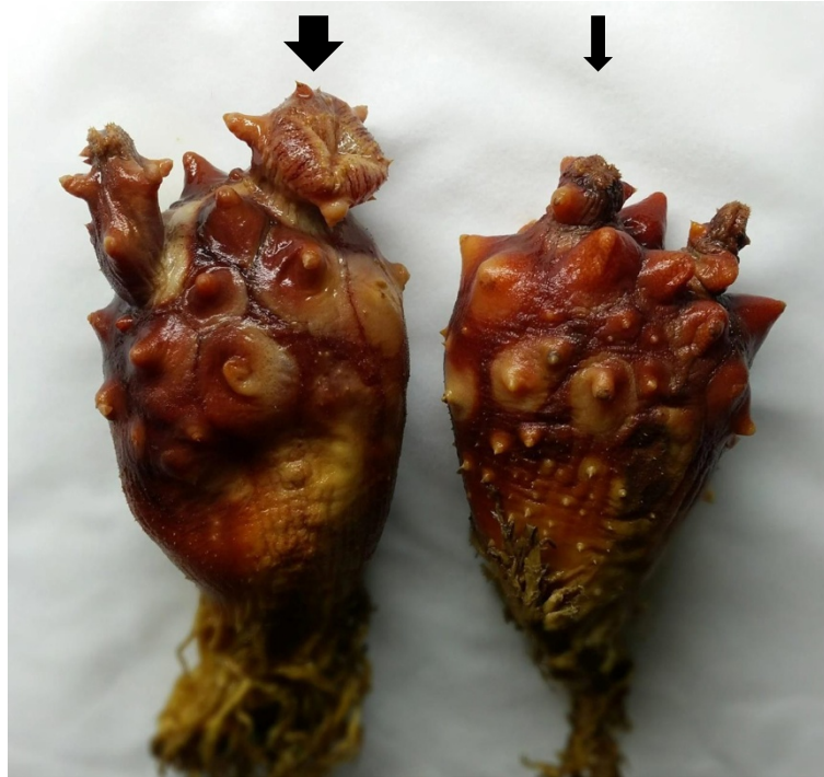
Figure 3 Swelling (large arrow) and normal (small arrow) of the branchial and atrial siphons of Halocynthia roretzi caused by A. hoyamushi infection.

the first stage of invasion [13]. This explains the considerably higher infection intensity in the siphons compared with that in the other parts of the tunic during the early phase of infection (KS-1). In addition, it is believed that the siphons are most suited for A. hoyamushi detection because of the presence of high infection intensity.