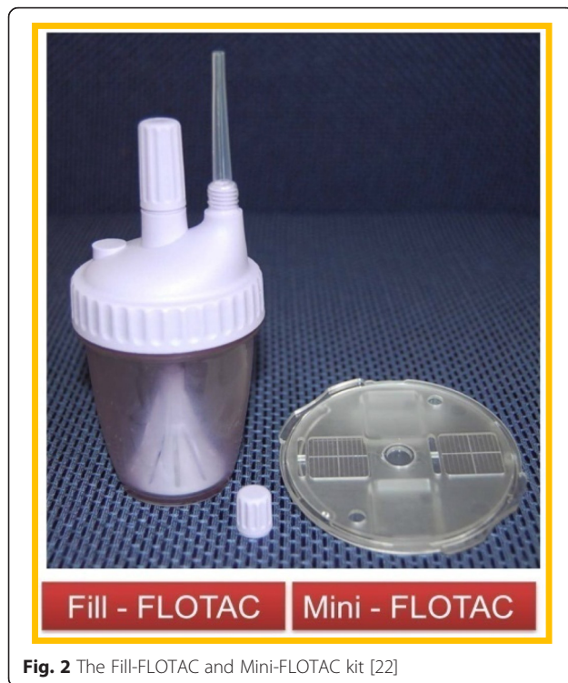
Fig. 2 The Fill-FLOTAC and Mini-FLOTAC kit [22]