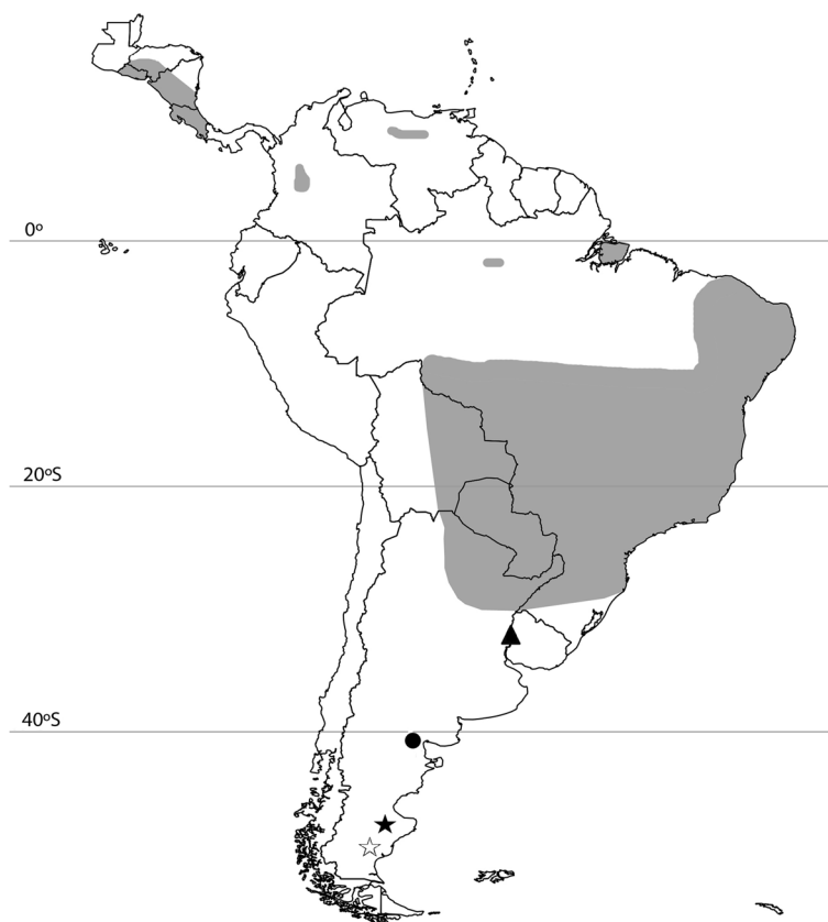
Fig. 1 Map of South America, showing the accepted distribution area of Leishmania infantum (grey area) [3], the southernmost record of a Phlebotominae (black circle) [19], the southernmost record of a competent vector (black triangle) [31], the Bosques Petrificados National Monument (black star), and the Monte León National Park (white star)

National Park (ML; 50°14'S, 69°00'O), both in Santa Cruz province, Argentinean Patagonia (Fig. 1, Table 1). The dominant habitat is shrub-steppe with < 50 % cover. The climate is dry and cold, with frequent frosts. The mean annual temperature is 10 °C (ranging from -10 °C to 30 °C), and annual rainfall ranges from 100 to 300 mm. Dogs are very rare in the study areas, with few individuals in some ranches surrounding the parks. Unpublished preliminary data estimated South American grey fox ( Pseudalopex griseus ; syn. Lycalopex griseus ) density at around 0.3 foxes/100 ha, and culpeo fox ( P. culpaeus ) density at around 0.1 foxes/100 ha (A. Travaini and A. Rodríguez, unpublished data). The grey fox is widespread in plains and mountains on both sides of the Andes in Chile and Argentina [9], whereas the culpeo fox is distributed throughout the Andes and hilly regions of South America from Colombia to Tierra del Fuego [10]. We captured 34 free-living foxes, including 32 grey and 2 culpeo foxes. Foxes were caught between November 2010 and October 2013 with Oneida Victor #1.5 soft-catch coil spring traps (Cleveland, OH, USA), anaesthetized with a combination of tiletamine and zolazepam (Zoletil, Virbac, Spain). Blood obtained from the cephalic vein was either applied (100 µl